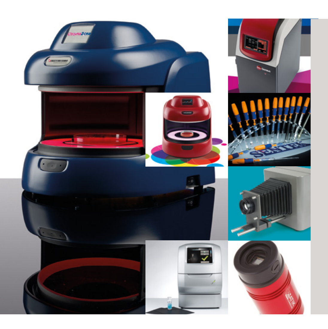
Scientific Digital Imaging plc Interim Report 2016